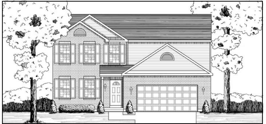
Elevation B (shown with 4 bedrooms)